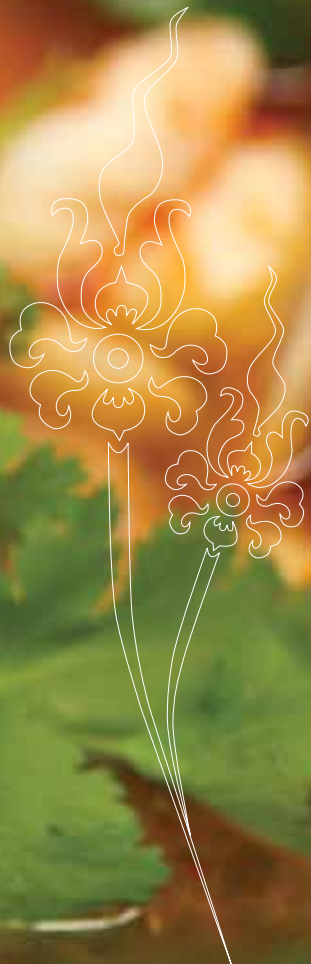
Tom Yum Goong